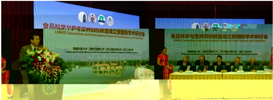
LWMZ University Consortium of Food Science and Nutrition